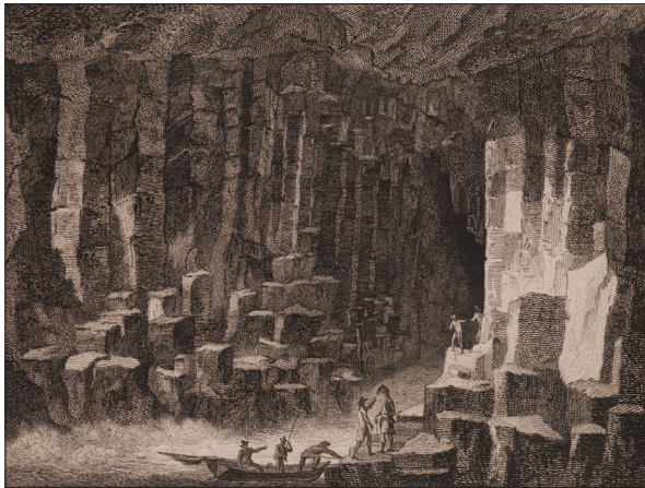
Fingal's Cave (circa 1802) – an inspiration for The Hebrides .

Travelling through Scotland, young Felix Mendelssohn was inspired by the rugged coastline, the isolated islands to the North, and the sights, smells, and sounds of the stormy Atlantic. He constructed this masterpiece of tone-poetry, which creates impressions of overlapping waves that build to overwhelming storm before dissolving into the cries of gulls and calm serenity.