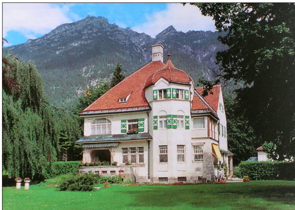
The Strauss-Villa, in which the Oboe Concerto was written.

During World War II, Richard Strauss had witnessed the destruction of the cultural edifices of his homeland and the murder of Jewish family members and artistic collaborators. In its aftermath, Strauss experienced a late artistic flourishing, including this Concerto for Oboe and Small Orchestra . Musically, the concerto looks inwards and backwards, to the spirit of the waltz and the grace of